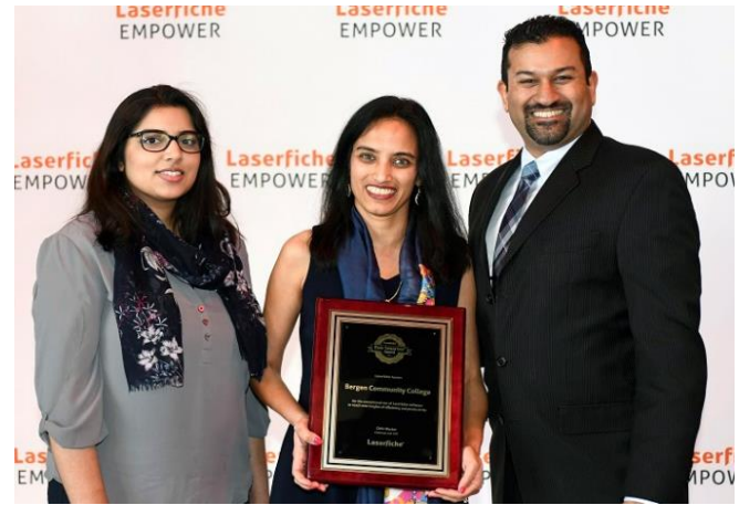
Bergen Community College was the recipient of the 2018 Laserfiche Run Smarter Award for demonstrating excellence in innovation.

Laserfiche has been foundational for process improvement at Bergen Community College for years, but they never imagined it would become a fundamental element of their transition to remote work. The impact of COVID-19 has been felt by everyone, but for the Bergen Community College staff and students, many tasks that would have been almost impossible to complete remotely never missed a beat. Through simplifying life with Laserfiche Bergen has mitigated major disruption to their student's lives while combatting the COVID-19 crisis.